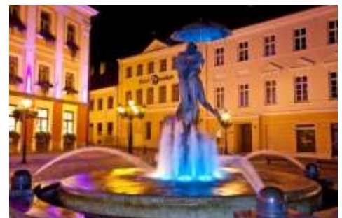
Tartu – town of kissing students!

Training course will take place in Estonia; you can find more information about our country here: http://www.visitestonia.com/en/ . If you come earlier or leave later (highly recommended!), you can visit our capital Tallinn: http://www.tourism.tallinn.ee/eng which has really nice medieval old town and is in the UNESCO world heritage list. You can also visit Tartu: