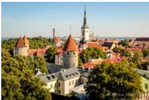
Medieval old town of Tallinn

Training course will take place in Estonia; you can find more information about our country here: http://www.visitestonia.com/en/ . If you come earlier or leave later (highly recommended!), you can visit our capital Tallinn: http://www.tourism.tallinn.ee/eng which has really nice medieval old town and is in the UNESCO world heritage list. You can also visit Tartu: